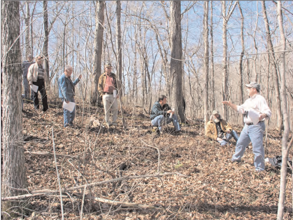
University of Arkansas-Monticello Arkansas Forest Resources Center faculty scientist teaching a wildlife habitat management clinic in Independence County, Arkansas, to landowners as part of ongoing, University of Arkansas-led forest landowner education clinics.