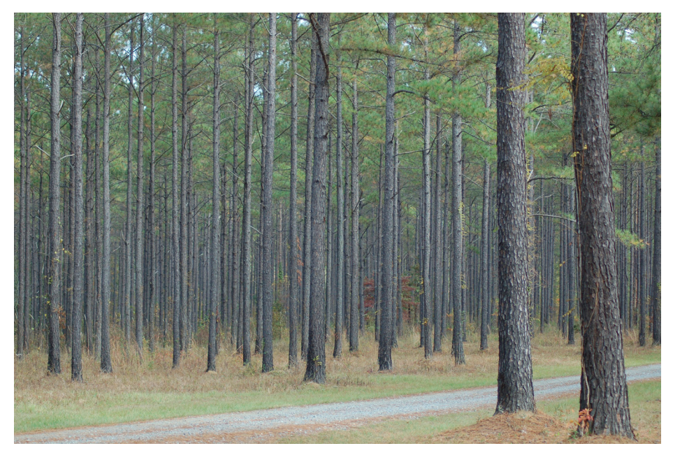
A family-owned pine plantation in central Georgia.

The forestry and forest products industry substantially impacts the combined economy of the 13 states1 in the southern region. Not only does forestry have significant direct impacts to the economy, but these industries, through purchase of various goods and services, create more activity and impact other sectors of the economy. These impacts amount to more than $230 billion in total industry output, nearly $90 billion in value-added services. almost $50 billion in wages and salaries, and more than a million jobs.